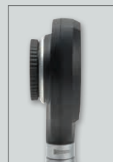
without contact plate